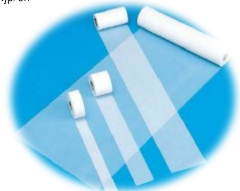
NAFLON™ PTFE Tape